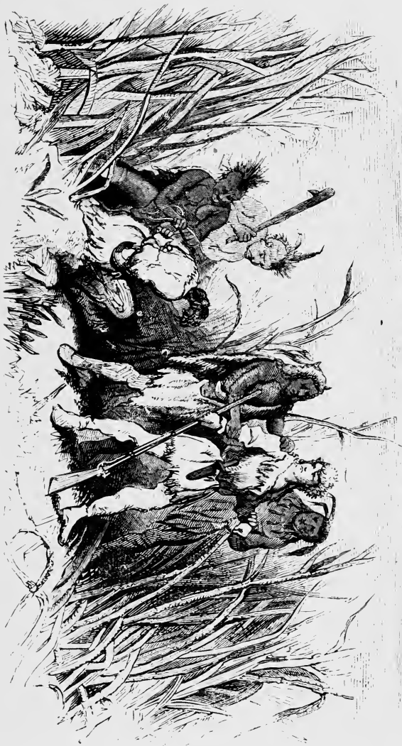
CAPTURE OF ROONE AND STUART.